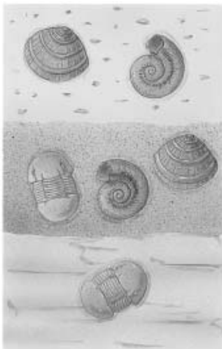
Fossil Range Chart